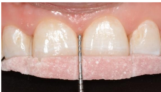
Figure 1: Measuring the height of the black triangle (PT-CP distance)

In the injection phase, 3 injections were given at each papilla site: at baseline, 3- and 6-weeks intervals. At the first injection visit, before attempting to inject, clinical measurement of the height of the black triangle was done by measuring the distance between the deficient papilla tip and contact area (PT-CP distance) to the nearest 0.5 mm (baseline). This was done using a graduated periodontal probe and the fabricated customised stent for proper and standardised positioning of the probe at each measurement interval, as shown in Figure 1.