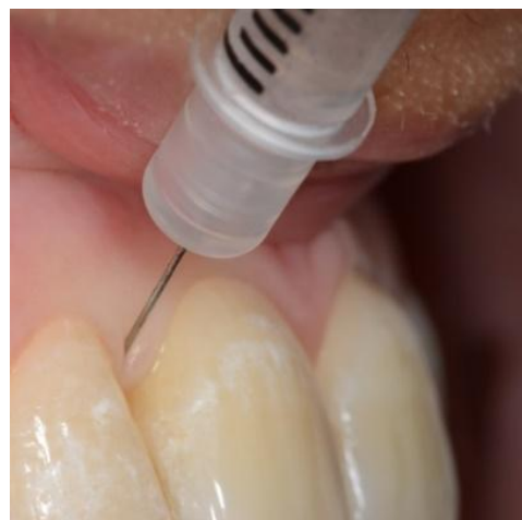
Figure 2: Injection technique

Every injection procedure starts with the administration of short-acting local anaesthesia using infiltration technique. The deficient papilla was injected with 0.1 mm of HA gel or saline solution using a 30-gauge disposable insulin syringe. Hyaluronic acid and saline were pre-loaded in insulin plastic syringes before injection for patient blinding. The needle was inserted 2-3 mm apical to the tip of the interdental papilla and directed coronally with an angulation of 45° to the long axis of the tooth, and the bevel directed apically (Figure 2). Then, the papilla was lightly moulded in an incisal direction for 1 minute using gauze. Finally, post-injection instructions were prescribed where 24-hour abstinence from mechanical plaque control in the area and the use of mouthwash twice daily only was advocated. The use of a soft toothbrush, together with the use of mouthwash, was indicated after the first 24 hours. Routine mechanical oral hygiene was resumed after 2 weeks.