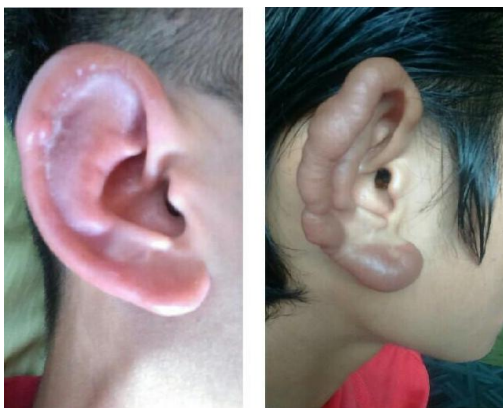
Figure 1: Left – initial presentation. Right – after 2 years

A 21-year-old male patient from Malaysia, with no significant past medical history, presented with complaint of painless erythematous bilateral pinna skin lesions for two weeks. He had no history of contact to any irritant or trauma and has no other skin lesions elsewhere. He was afebrile at the time of presentation and had a normal pulse rate and blood pressure. Dermatologic examination revealed erythematous and skin-coloured subcutaneous papules on both his pinna, which were painless (Figure 1). There were no other skin lesions or areas of paraesthesia on the body. Cardiovascular, respiratory and other system examinations were also normal. He was diagnosed to have infective perichondritis and received a course of broad-spectrum antibiotics, without any relief.