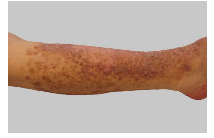
Figure 1: Disseminated lichen planus of the leg (right leg)

lower leg fracture 30 years ago. She had no weight loss or fever but reported a local pain.