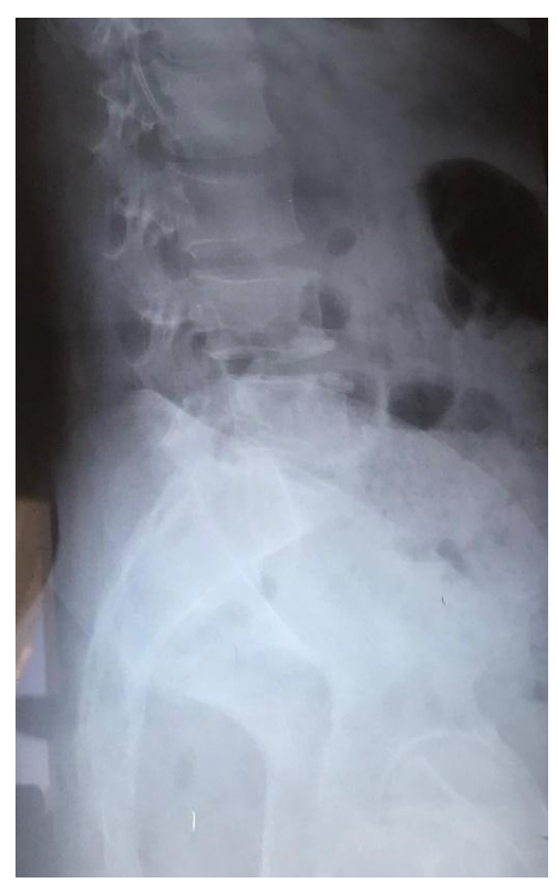
Figure 2: Biconcave vertebral bodies (fish vertebrae) and upper anterior fracture of the 5<sup>th</sup> lumbar vertebra osteophyte

To avoid malabsorption of vitamin D due to gastrointestinal lymphoplasmacytic inflammatory infiltrates, it was initiated Cholecalciferol (vitamin D_3 ) i.m. 300 000 UI at once, followed by vitamin D_3 50 000 UI/per week oral solution and, calcium 1000 mg 1x1 daily together with dairy products for one month, then followed with 25 000 UI/per week oral solution for other two months. Appropriate sun exposure in daily bases was recommended and other necessary treatment. Last three months, appropriate doses of Vitamin D were ordered in oral tablets.