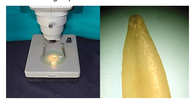
Figure 2: Actual working length determination under the stereomicroscope

The actual length (AL) was measured with the aid of a stereomicroscope (Magnus Opto Systems India Pvt. Ltd) under 8 X magnification by introducing a no. 15 K-file until it emerged at the apical foramen. The file was then withdrawn until its tip was tangential to the apical foramen (Figure 2). After adjusting the silicone stopper to the flattened reference point, the file was removed, and the distance between the file tip and the stopper was measured with digital callipers. To record the actual root canal length (AL), 0.5 mm was subtracted from it. This determined length served as the control group.