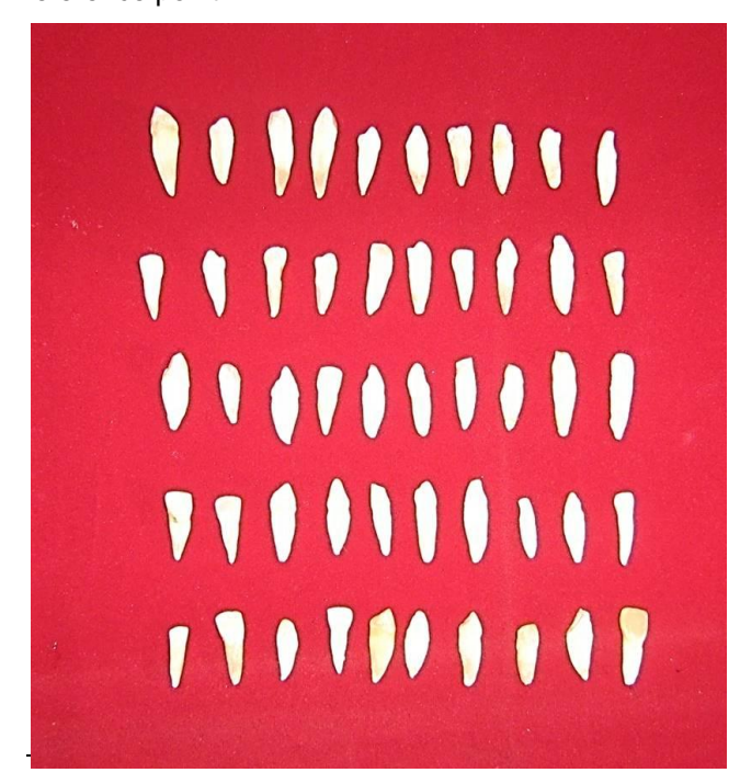
Figure 1: Fifty single-rooted teeth with definite coronal plane

Fifty extracted, single-rooted, single canal teeth, with mature apices, were used in this study (Figure 1). The criteria for tooth selection included intact enamel without caries, restorations or surface anomalies. Teeth were kept in 5% hypochlorite (Septodont health care India Pvt. Ltd) for 2 hours to remove the periodontal remnants and then stored in sterile 0.9% saline solution (Baxter India Pvt. Ltd) until use. A definite coronal plane prepared with carborundum disc (Dentorium, New York, USA) fixed on slow speed straight handpiece (Marathon, Korea) provided a fixed, stable surface for the adaptation of rubber stopper. This helped to avoid measuring errors resulting from different interpretation of the coronal reference point.