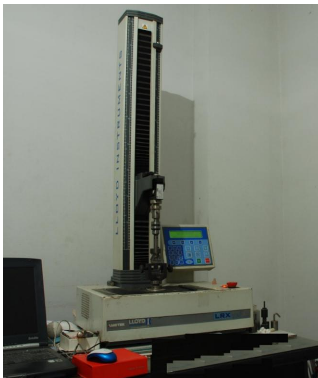
Figure 2: Universal Testing Machine

A circular interface shear test was planned to assess the bond quality. All tests were mounted on computer-controlled materials testing machine (Model LRX-Plus; Lloyd Instruments Ltd., Fareham, UK) with a load cell of 5 kN and data were recorded using computer software (Nexygen-MT; Lloyd Instruments) (Figure 2). Shear bond quality was decided by the compressive mode of force applied at the ceramic-tooth interface using a monobevelled chisel-shaped metallic rod connected to the upper movable compartment of the testing machine travelling at a cross-head speed of 0.5 mm/min.