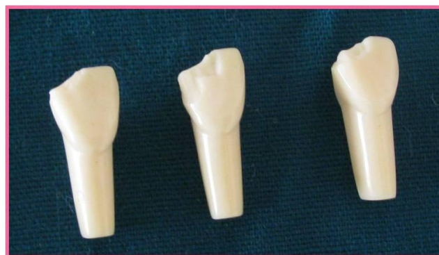
Figure 1: Different enamel preparation designs (Bevel, Stairstep Chamfer, Chamfer) on a typodont

Experimental fractures were made using low-speed diamond disc (JUNWEI, China) at a constant speed of 150 RPM. Using a standard diamond rotary bur (Mani Inc. Diamond bur TC-S21, ISO NO. 160/014), a 45° bevel extending 2 mm beyond the fractured incisal edge and through the entire enamel thickness, was given on the cavosurface margin of the tooth. Similarly with a standard diamond rotary bur (Mani Inc. Diamond bur SO-20, ISO NO. 288/012), a chamfer preparation and stair-step chamfer preparation was placed on the labial surface of teeth in their respective groups (Figure 1).