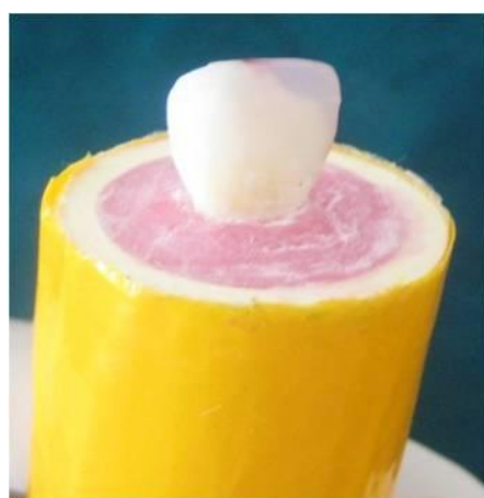
Figure 2: Completed restoration

Adper Single bond 2 Adhesive (3M ESPE, USA), a total-etch adhesive was applied on the prepared surface using adhesive applicator according to manufacturer's instruction and light-cured for 10 s using a quartz-tungsten-halogen light-curing unit (Optilux 501, Demetron; Danbury, CT, USA) with an irradiance of 500 mW/cm 2 . All the preparations were restored with nano filled composite using custom strip crowns in bulk pack technique (Figure 2).